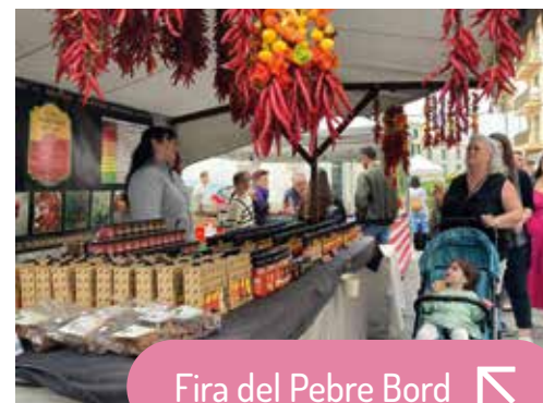
Fira del Pebre Bord ↖

The night-time Fira Marinera fills the port of Portocolom with crafts and cuisine linked to the sea, often as part of the Mare de Déu del Carme festivities. An evening to enjoy the stalls, local produce and the unique charm of the illuminated port.