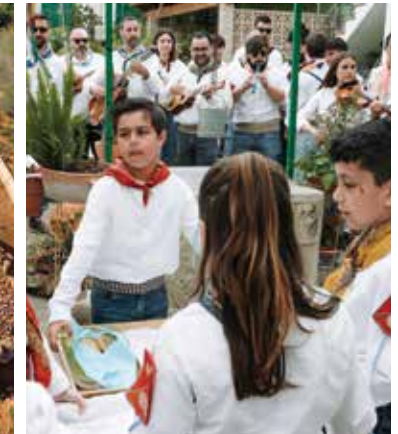
↗ Closos de Can Gaià