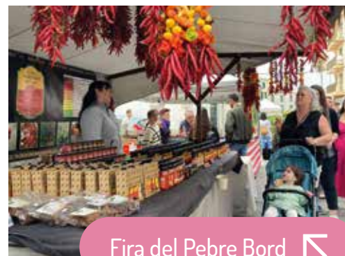
Fira del Pebre Bord ↙

The night-time Fira Marinera fills the port of Portocolom with crafts and cuisine linked to the sea, often as part of the Mare de Déu del Carme festivities. An evening to enjoy the stalls, local produce and the unique charm of the illuminated port.