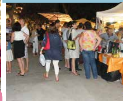
↘ Fira marinera nocturna