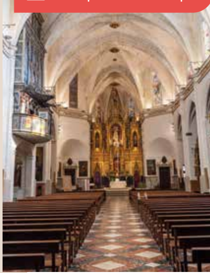
↙ Parroquia de Sant Miquel

Archaeology enthusiasts will find a key site in Felanitx: the Closos de Can Gaià settlement, near the coast, which dates back to the Bronze Age and consists of spectacular navetas (ancient tombs) shaped like inverted boats, declared a Site of Cultural Interest. Recent excavations have provided a better understanding of how those communities lived and how this settlement was organised, which is key to understanding the municipality's most distant past.