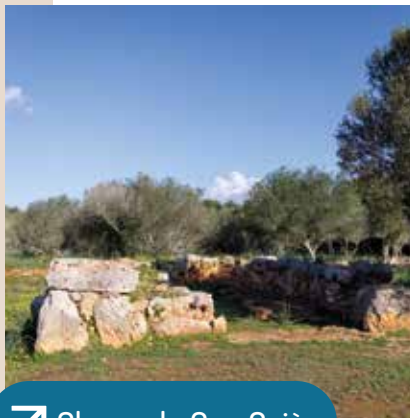
↗ Closos de Can Gaià